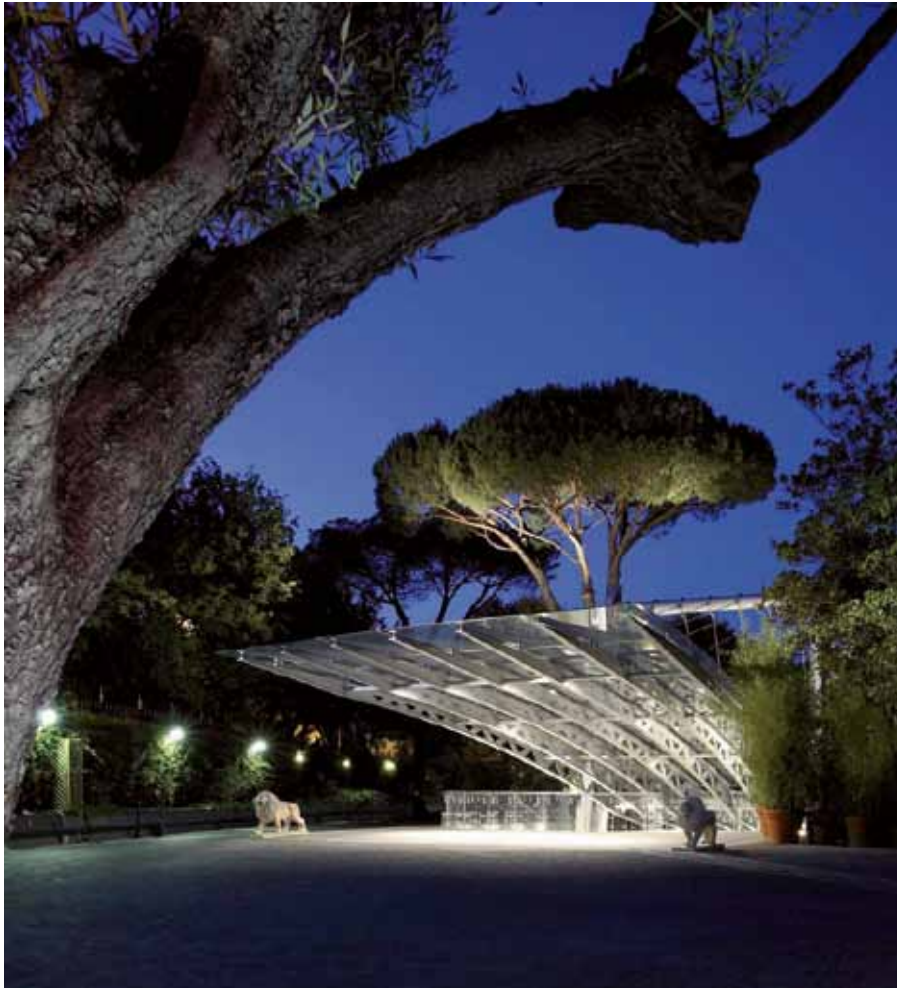
The Rome Cavalieri Hotel and Congress Center – the venue for the World Lottery Summit 2014.

The modern proverb “All roads lead to Rome” has its origin in the ancient reference to Roman roads and their relation to the Golden Milestone, a gilded monument erected by Emperor Caesar Augustus in the central Forum of Ancient Rome. All roads were considered to begin from this monument and the distances to all major cities of the Roman Empire were measured relative to this point. Conversely, the Golden Milestone was also seen as the specific point to which all roads in the Roman Empire led.