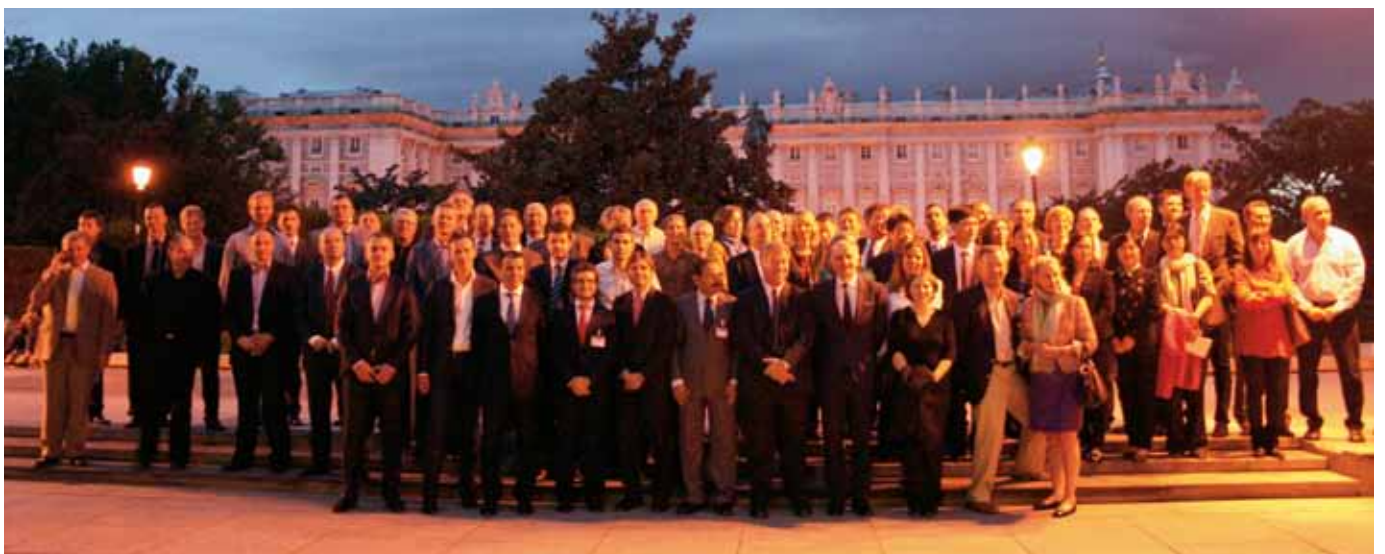
Participants of the joint WLA/EL security seminar held in Madrid, Spain from October 2–4, 2013.

Wide-ranging and exciting discussions will be in store at every event!